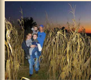
A 12-acre corn maze is just one of the many family activities enjoyed by visitors to Lyles Station throughout the year.