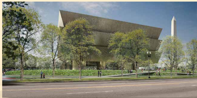
Architect's rendering of the new Smithsonian National Museum of African American History and Culture building under construction in Washington D.C. which will include several Lyles Station artifacts.