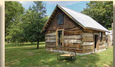
This log cabin, originally built in the Lyles Station community and later moved, has recently been reconstructed on the grounds of the school and houses visitor activities.